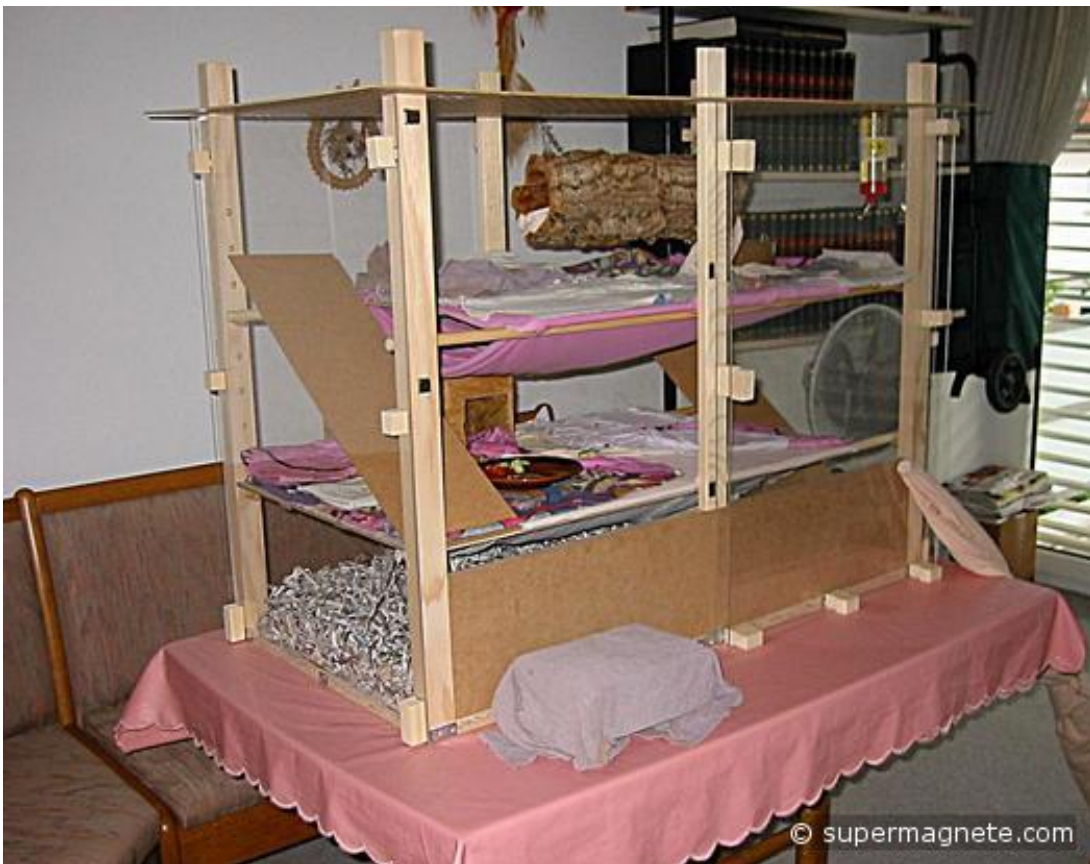
Here I removed the left Plexiglas plate, so you can see the Q-19-13-06-N ( www.supermagnete.de/eng/Q-19-13-06-N ) blocks in the supporting beams.