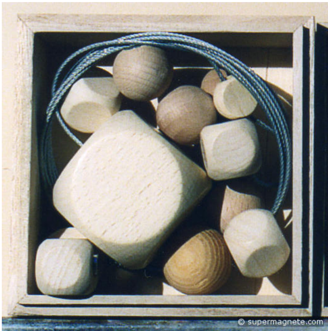
Wooden cubes and spheres