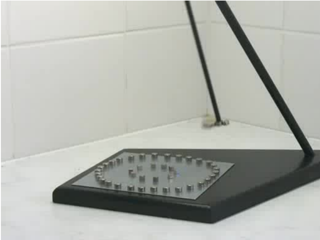
Video, 1.1 MB

A totally different pendulum movement, as shown in the video.