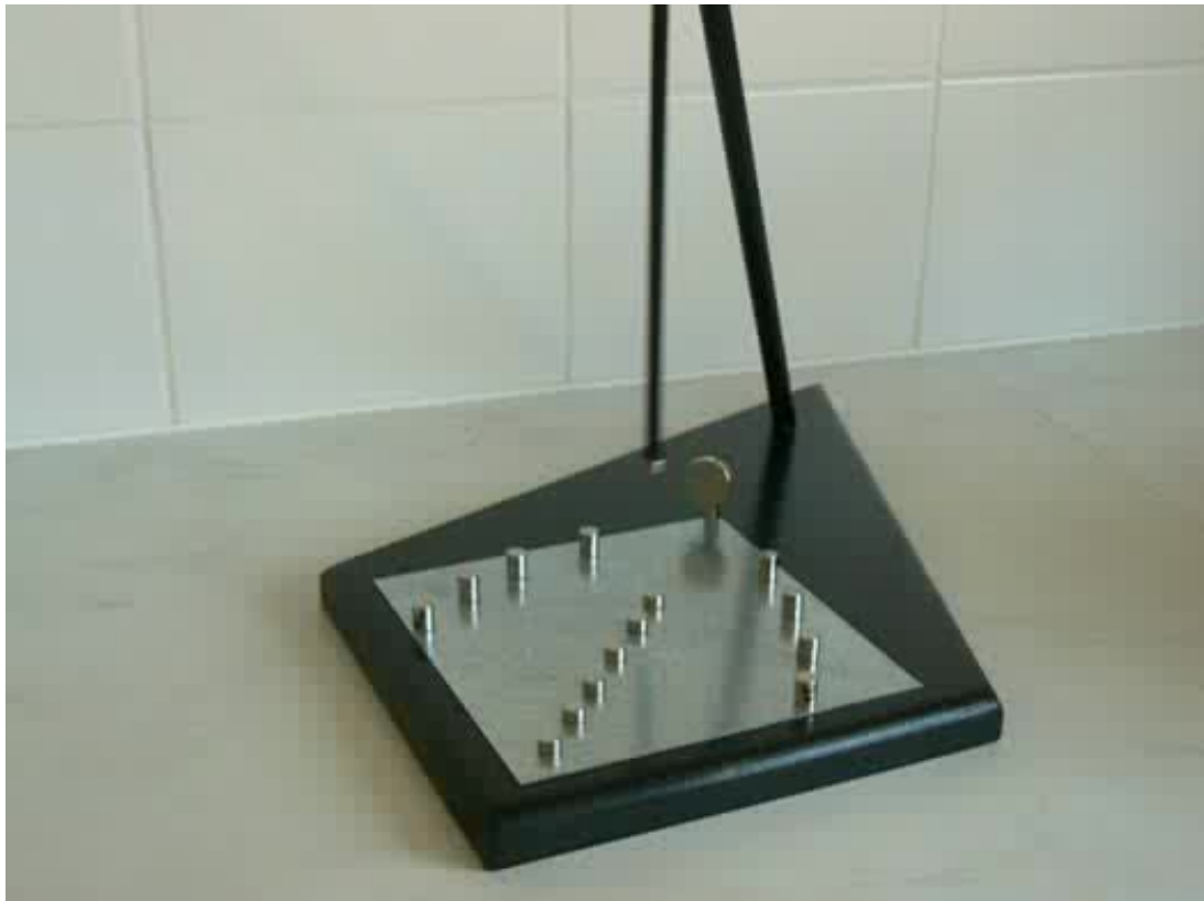
Video, 780 kB