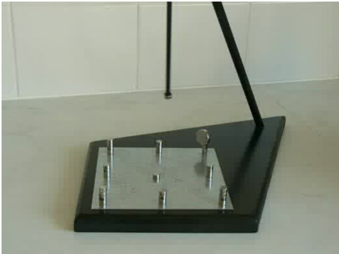
Video, 870 kB

Example 3: I totally changed the arrangement once more and the result is worth it! I added S-20-05-N ( www.supermagnete.de/eng/S-20-05-N ) and S-08-05-N ( www.supermagnete.de/eng/S-08-05-N ) discs to the hanging ring magnet. This leads to quick rotational movements. I arranged the rest of the disc magnets in a circle. Inside the circle I created another one with cube magnets.