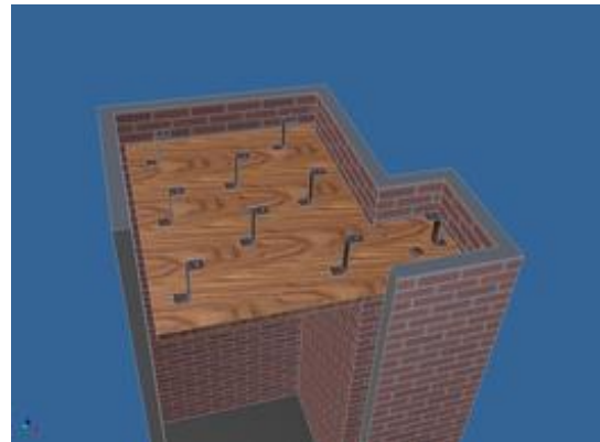
Slanted view from above

Thanks to its many magnets the board is secured to the beams.