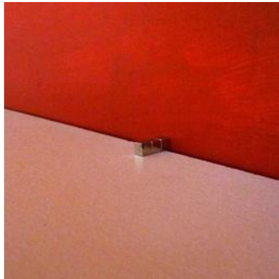
Shelf with magnets

The first block of three I placed in the centre of the shelf at the back of the back panel. You can clearly see the annoying gap here.