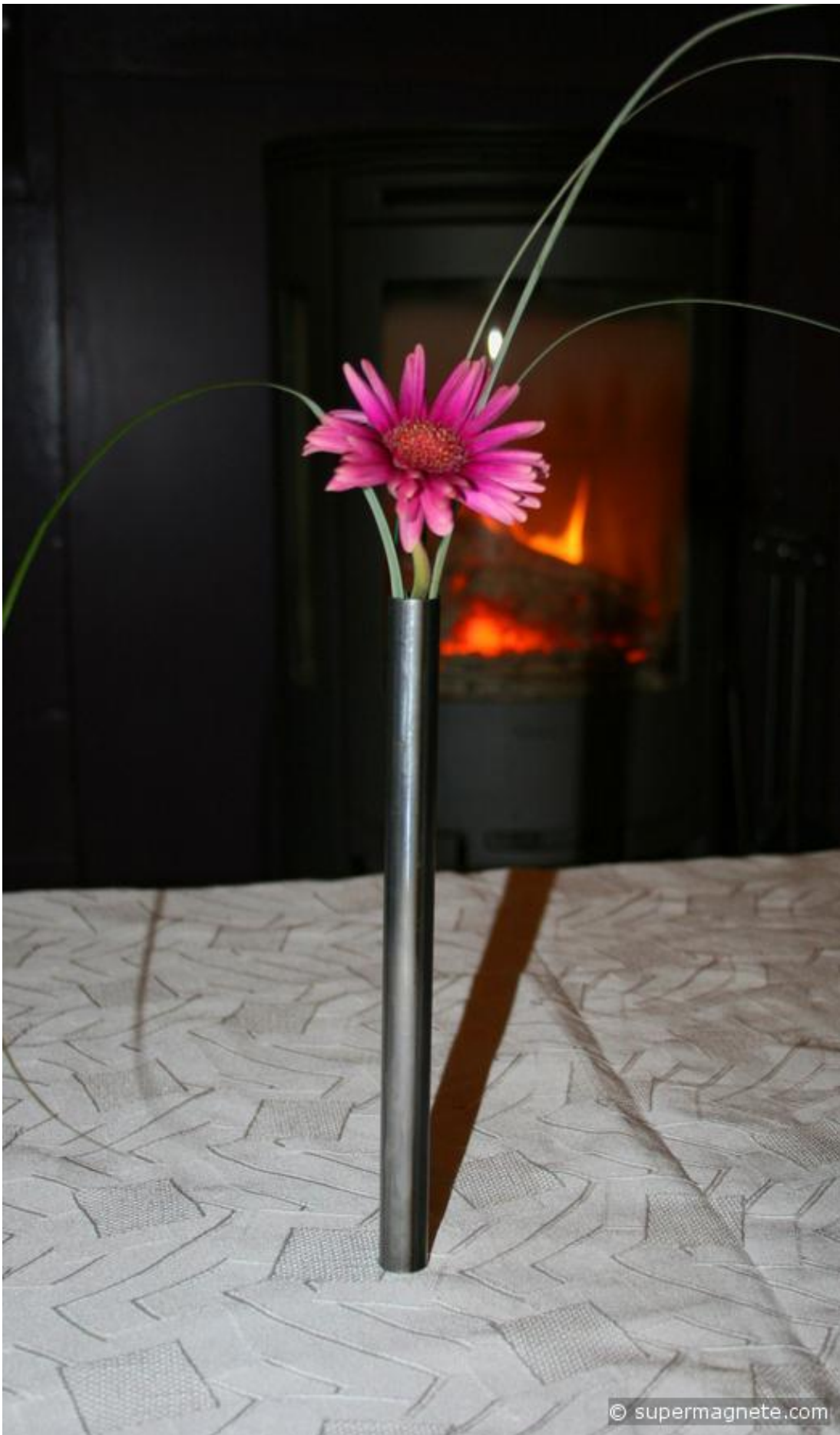
The vase seems to stand stable on the table on its own.