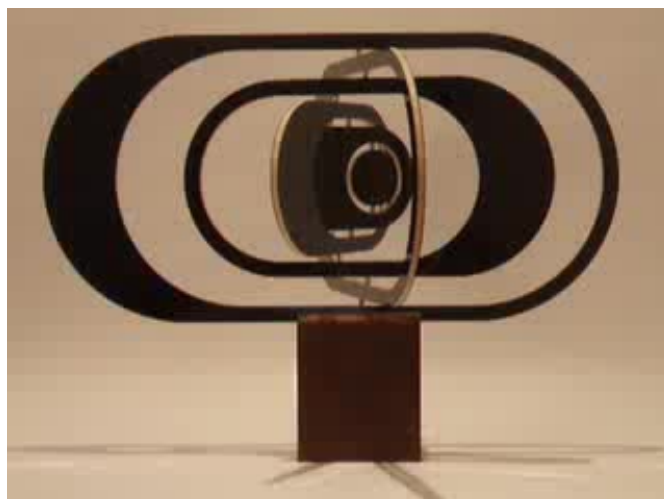
Video, 2.8 MB