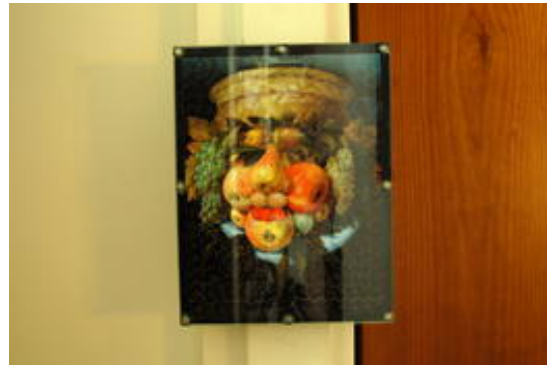
Is that a face...

The puzzle is from PMW ( www.pmw.fr ) and was produced for a special exhibition in the Musée du Luxembourg.