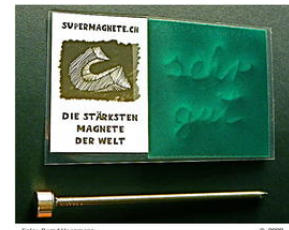
Flux detector as data storage

Execution of the model experiment: The magnet will be attached to the nail head. The flux detector Flux Detector laminated ( www.supermagnete.de/eng/M-05 ) is already laminated to protect against scratching. The type Flux detector small ( www.supermagnete.de/eng/M-04 ) should be placed under a foil and on a white sheet of paper. With the nail point you write data (characters, words, etc.) on the detector. The data is best legible with a sideways exposure to light (see picture). The written data remains legible even after you remove the nail. Mechanical tremors don't influence the legibility at all. The data can be erased when you move the nail flat over the foil.