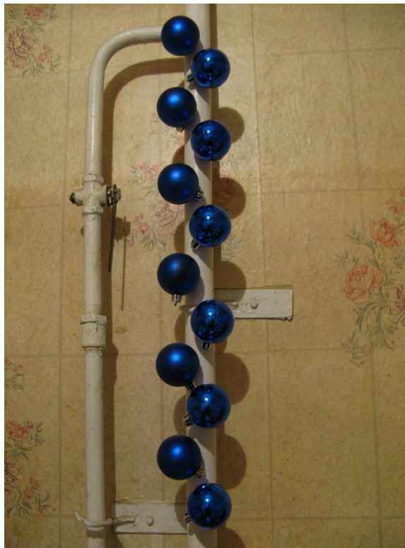
The Christmas tree ball ornaments beautify, for instance, unsightly pipes in the bathroom