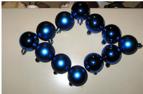
The Christmas tree ball ornaments can be arranged in geometric patterns...