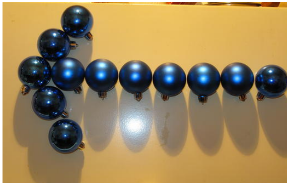
... or guide your way to the toilet / outside