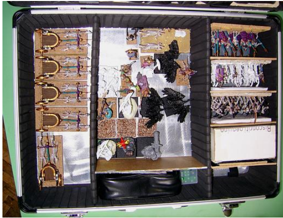
A carrying case full of Warhammer miniatures