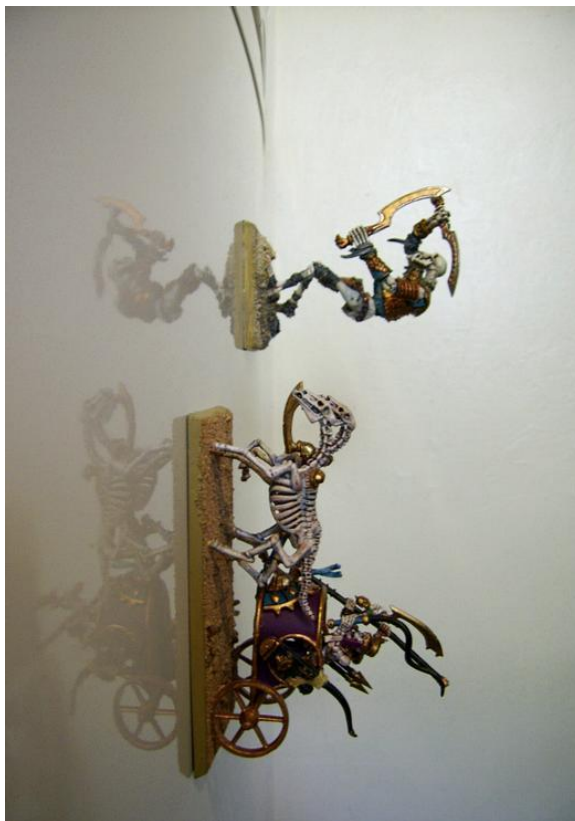
The prepared miniatures can also conquer the refrigerator :-)