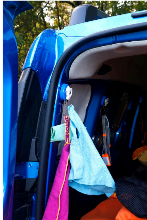
Magnetic hook turns into towel holder

These double hook magnets ( www.supermagnete.de/eng/M-90 ) work great as towel holders in campers. The magnetic hooks quickly make room for hand towels without having to drill holes into your beloved bus or furniture. Especially in small spaces like this, it is convenient for things like towels to have their place. It keeps the space tidy and you'll always have towels handy. It's also convenient that the towels can dry on the hooks.