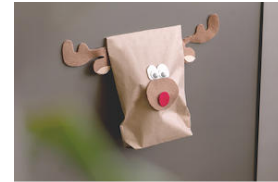
DIY Gift Bags with magnetic closure